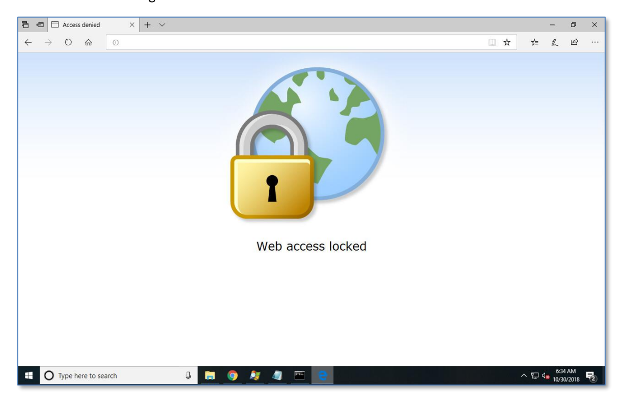
Figure 2 - Lock web on Edge

When the Teacher turns Lock web on, a graphic will be displayed in the Microsoft Edge tabs, indicating that the Student is not allowed to navigate on the internet.