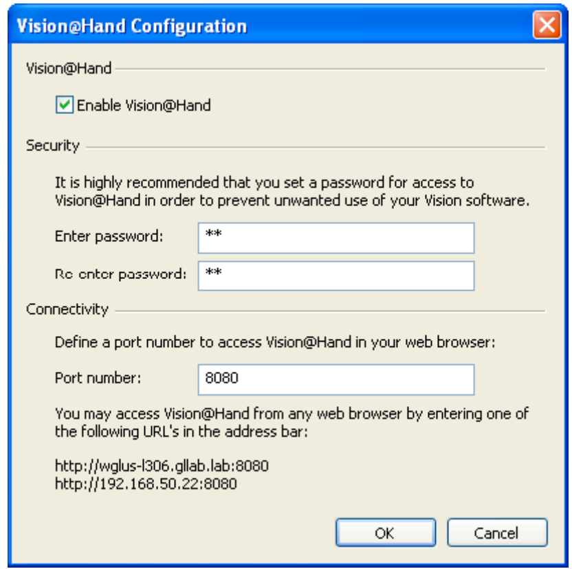
Vision@Hand Configuration utility

By default, Vision@Hand is enabled and uses the password set during installation.