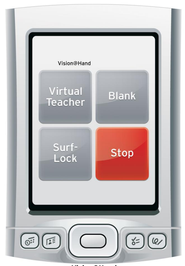
Vision@Hand (PDA not included)

Vision@Hand provides a simple, easy-to-read interface that allows you to see what actions are currently in use. It can be used with a wide variety of web browsers that allow the user to navigate to the teacher's computer from a PDA or other mobile device.